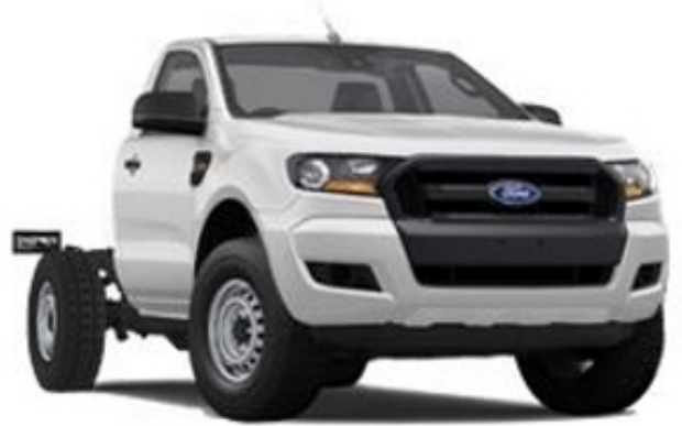
*Picture provided is a sample only