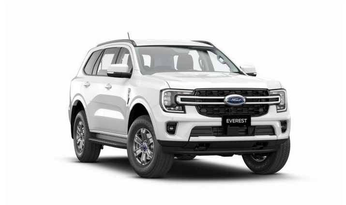
*Picture provided is a sample only