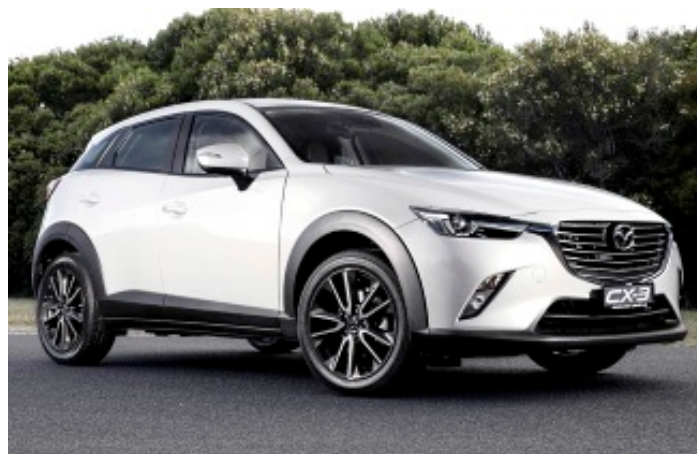
*Picture provided is a sample only