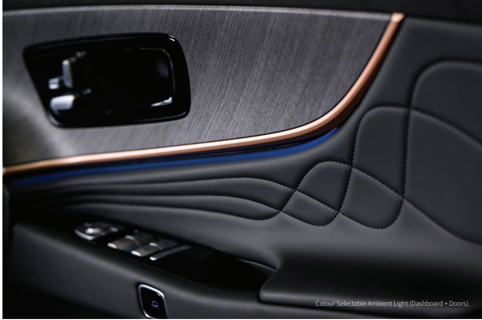
Colour Selectable Ambient Light (Dashboard + Doors).