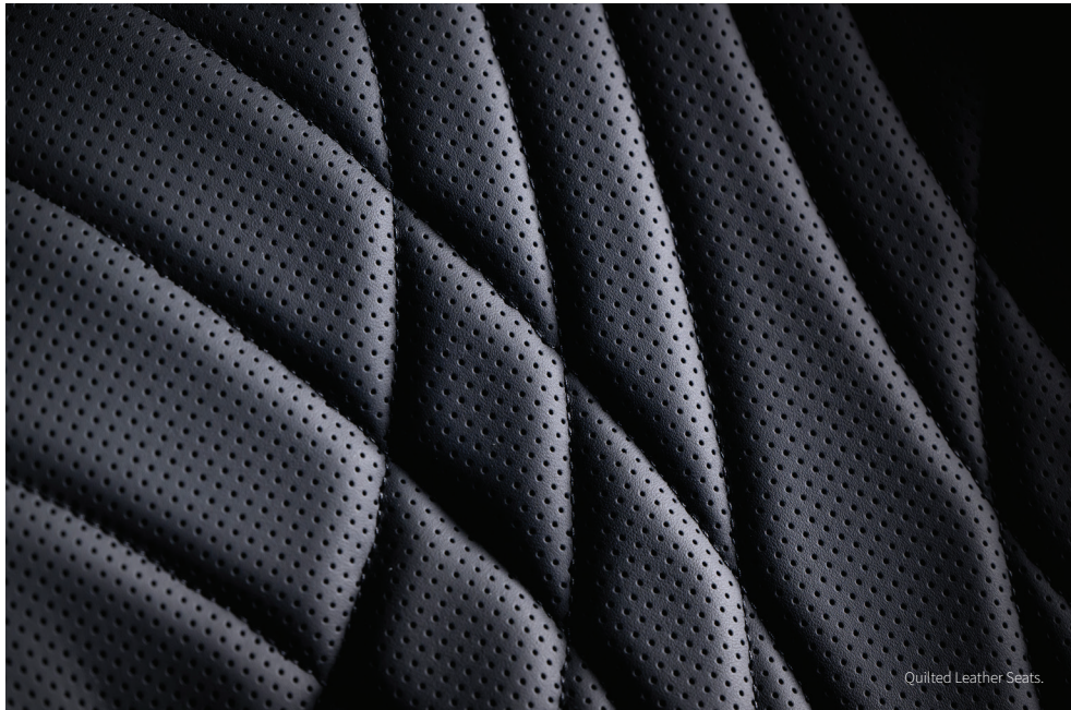
Quilted Leather Seats.