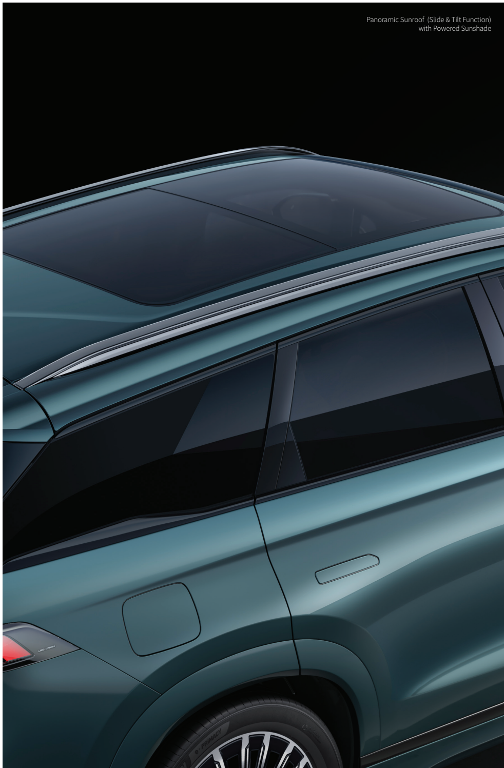
Panoramic Sunroof (Slide & Tilt Function) with Powered Sunshade