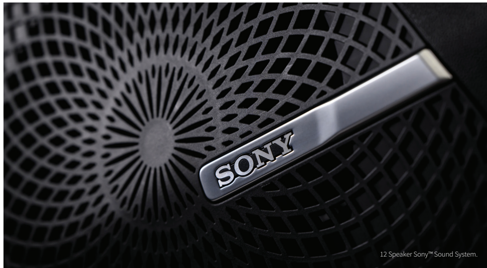
12 Speaker Sony™ Sound System.

*Wireless Charger Requires A Compatible Device