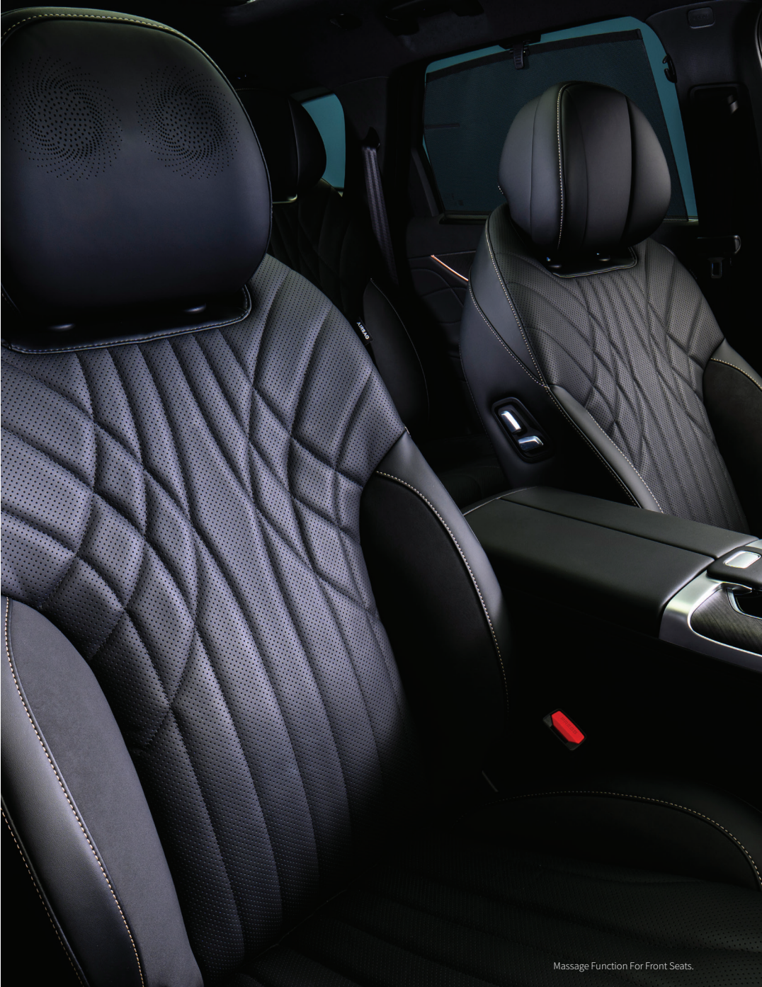
Massage Function For Front Seats.