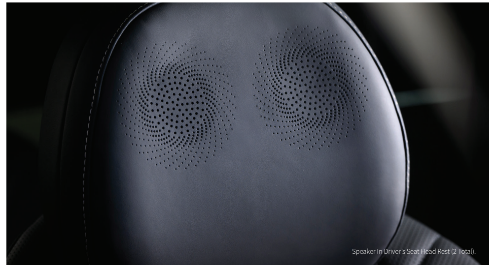
Speaker In Driver's Seat Head Rest (2 Total).