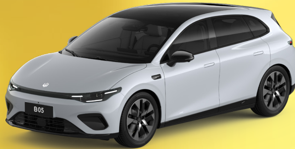
Galaxy Silver (0DS) (Optional)