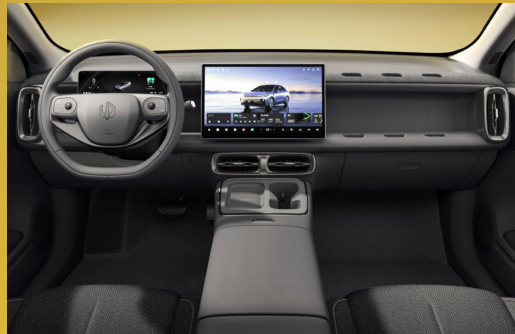
Grey Fabric Style (0CL)