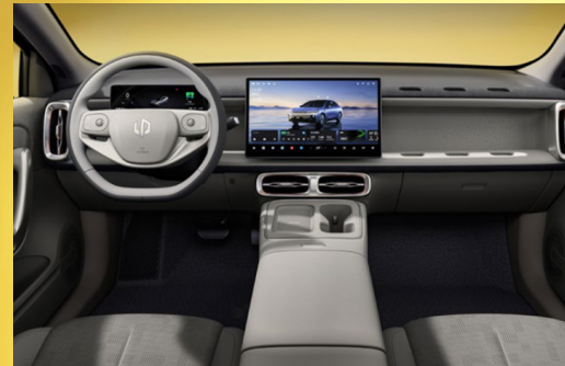
Light Grey TechnoLeather Design LR (0DN)