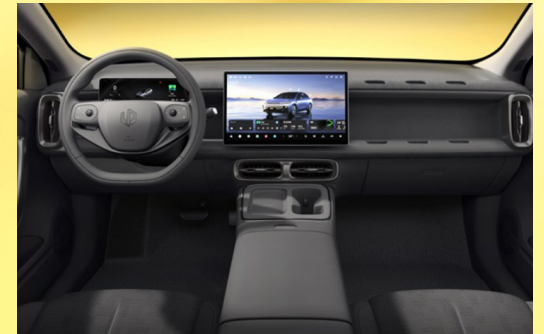
Shadow Grey TechnoLeather Design LR (0CQ)