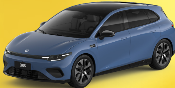
Starry Night Blue (0XC) (Optional)