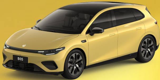
Lightning Yellow (0PA) (Standard)