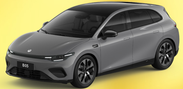
Windy Grey (0SA) (Optional)