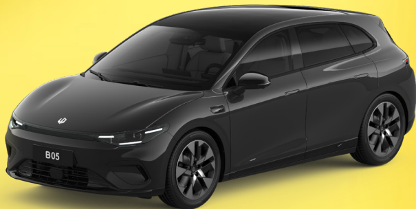
Metallic Black (0KL) (Optional)