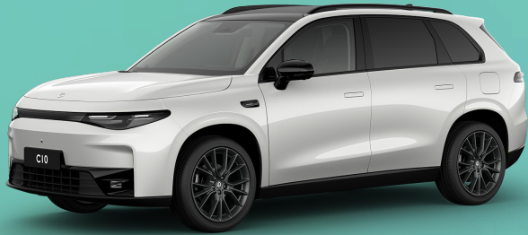
Pearl White (0AH) / Light White (0AG) (Standard)