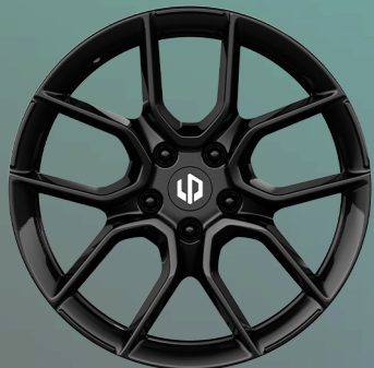
Double Five Spoke Wheel 18-inch alloys.