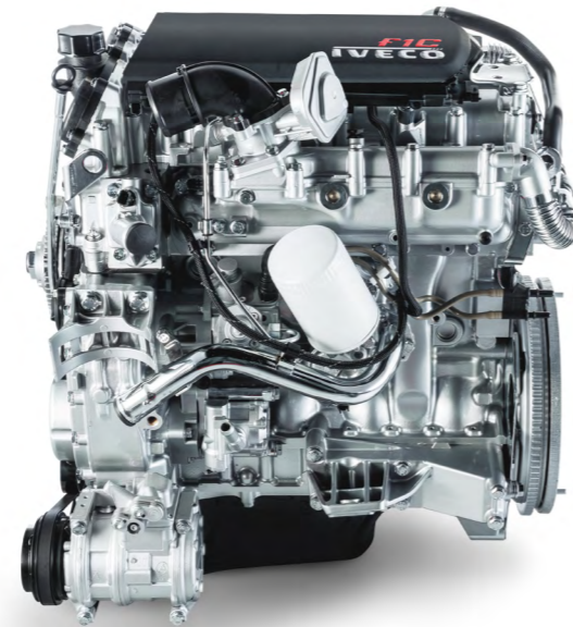
3.0-litre FIC Diesel engine

e-VGT: Electronic Variable Geometry Turbocharger; VGT: Variable Geometry Turbocharger