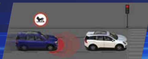
AUTO EMERGENCY BRAKING