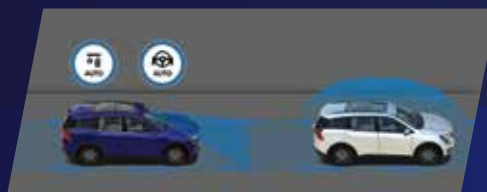
SMART PILOT ASSIST