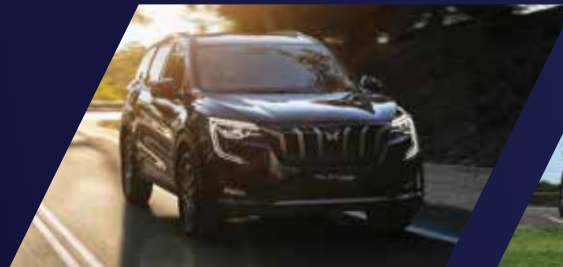
DISTINCTIVE CLEAR-VIEW LED HEADLAMPS WITH DRL

The new XUV700 is effortlessly impressive with its bold stance and style lines. Add the Skyroof™ and distinct LED lights, and you've got an SUV that can't be ignored.