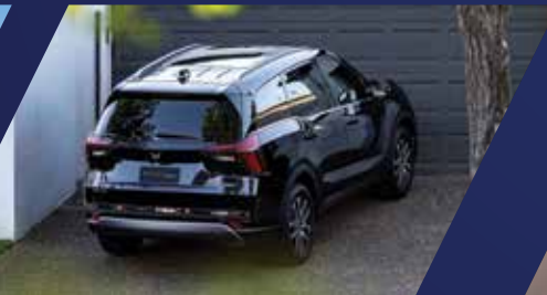
STRIKING DESIGN WITH CUTTING-EDGE SAFETY