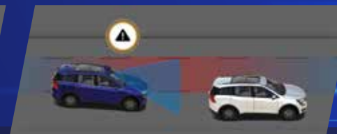
LANE KEEP ASSIST