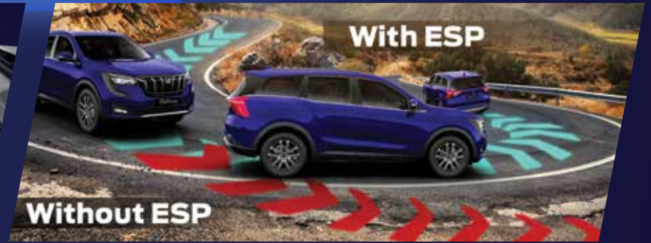
LATEST-GENERATION ELECTRONIC STABILITY CONTROL