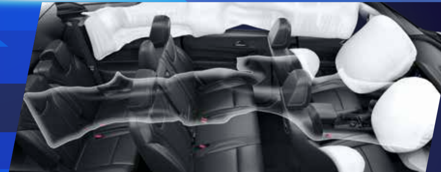
6 AIRBAGS STANDARD + ADDITIONAL KNEE BAG*