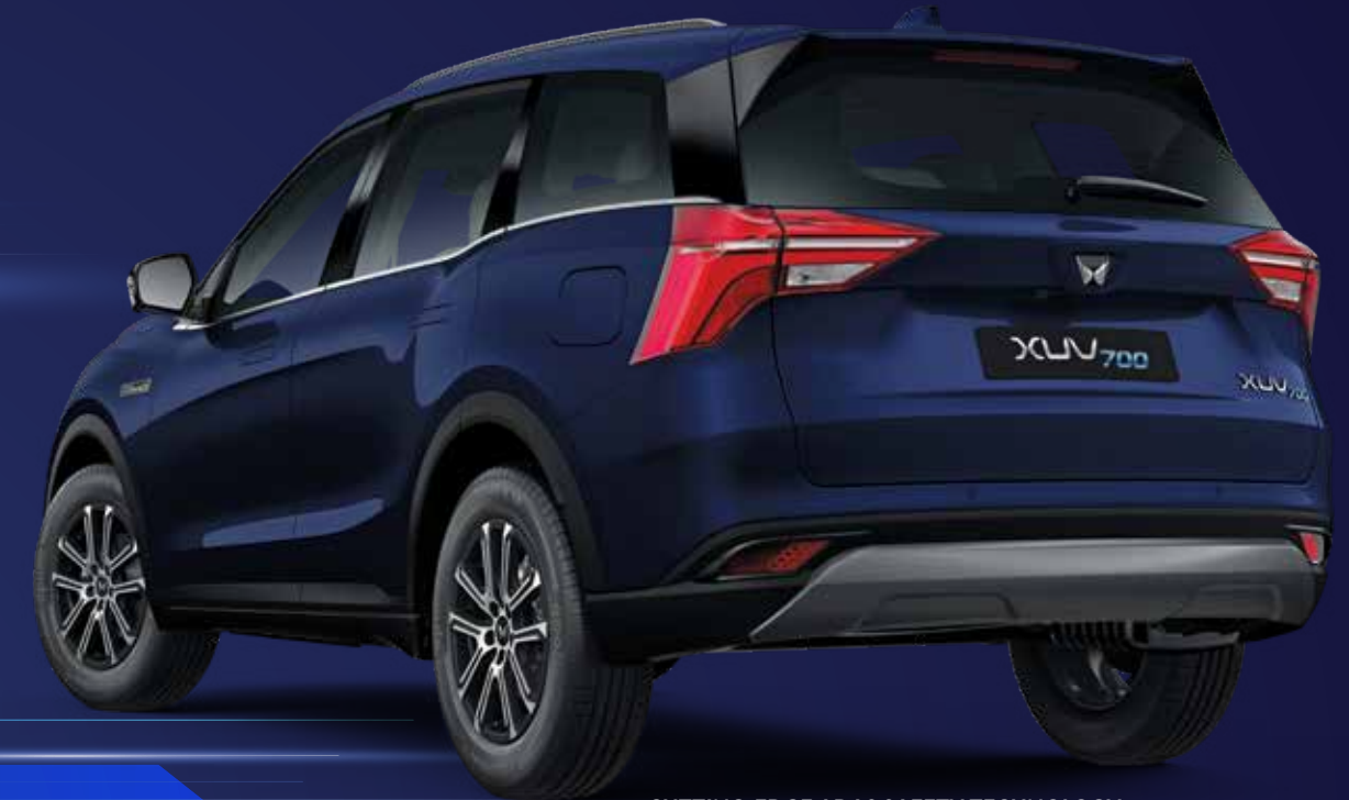
CUTTING-EDGE ADAS SAFETY TECHNOLOGY