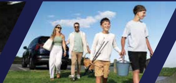
REFINED LUXURY MEETS FAMILY FUNCTIONALITY