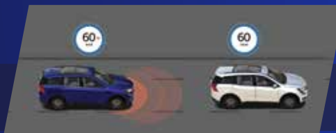
ADAPTIVE CRUISE CONTROL