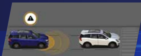
FORWARD COLLISION WARNING