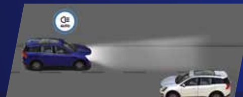
HIGH BEAM ASSIST