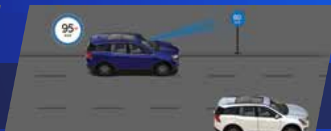
TRAFFIC SIGN RECOGNITION