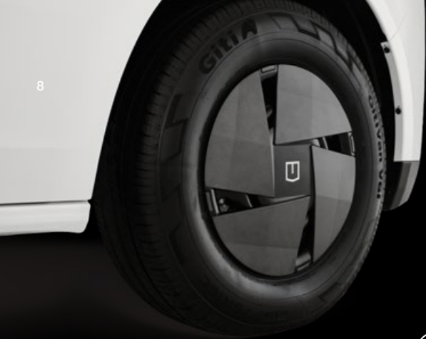
⤴ 16" Steel Wheel With Decorative Cover