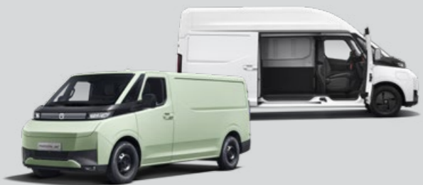
Mobile Power Station