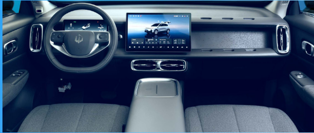
Grey Fabric Style BEV / Style HYBRID EV (0JP)