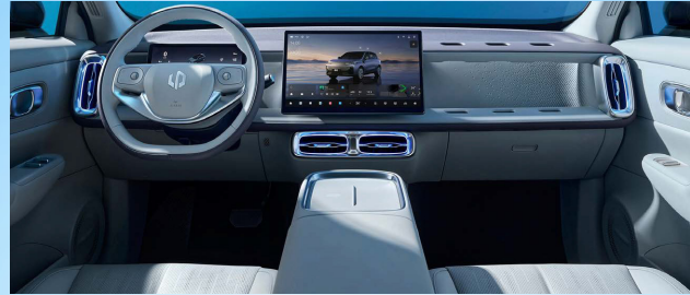
Light Grey TechnoLeather Design LR BEV / Design HYBRID EV (0JS)