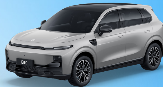
Terra Grey (0GD) (Optional)