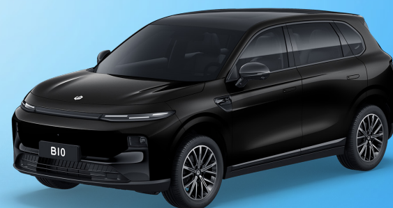
Metallic Black (0KL) (Optional)