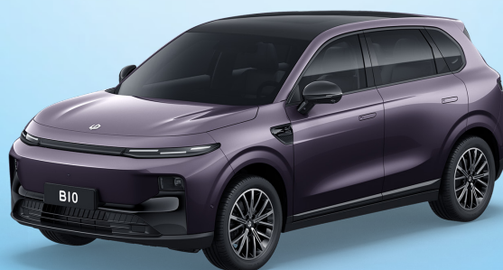
Dawn Purple (0UB) (Optional)