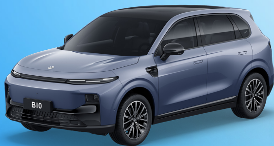
Starry Night Blue (0XC) (Optional)