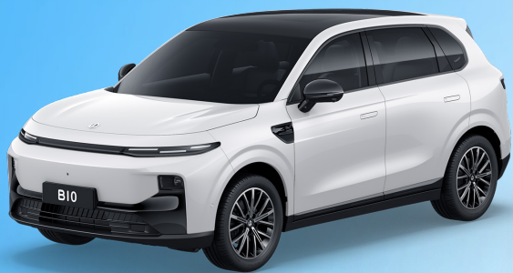
Light White (0AG) (Standard)