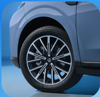
Star Sports Wheel 18-inch Alloys