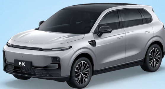
Galaxy Silver (0DS) (Optional)