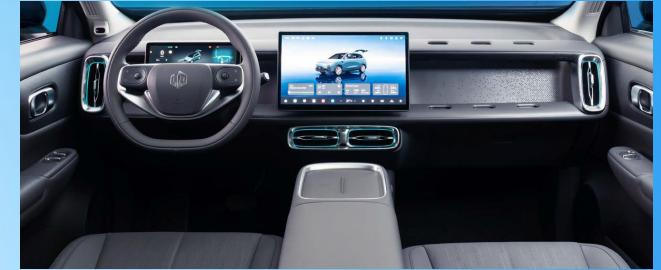
Shadow Grey TechnoLeather Design LR BEV / Design HYBRID EV (0WL)