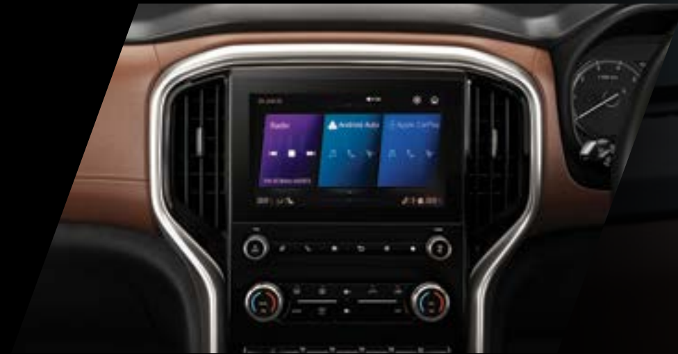
Wireless Android Auto and Apple Car Play