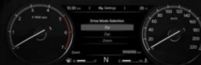
3 Drive Modes - Zip, Zap and Zoom

5 YEAR CAPPED PRICE SERVICING 4.7 CENTS PER KILOMETRE