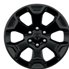
20-Inch black aluminium