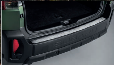
CARGO STEP PANEL - STAINLESS