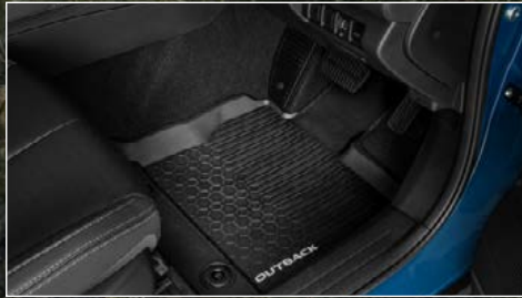
RUBBER MAT SET