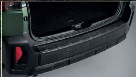
CARGO STEP PANEL - RESIN