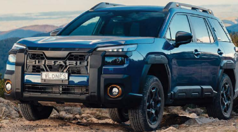
Subaru Outback AWD Wilderness. Optional premium paint shown.

Engineered to support your journey wherever it leads, the all-new Subaru Outback range marks the next evolution of Subaru capability. Outback by name, Wilderness by nature.