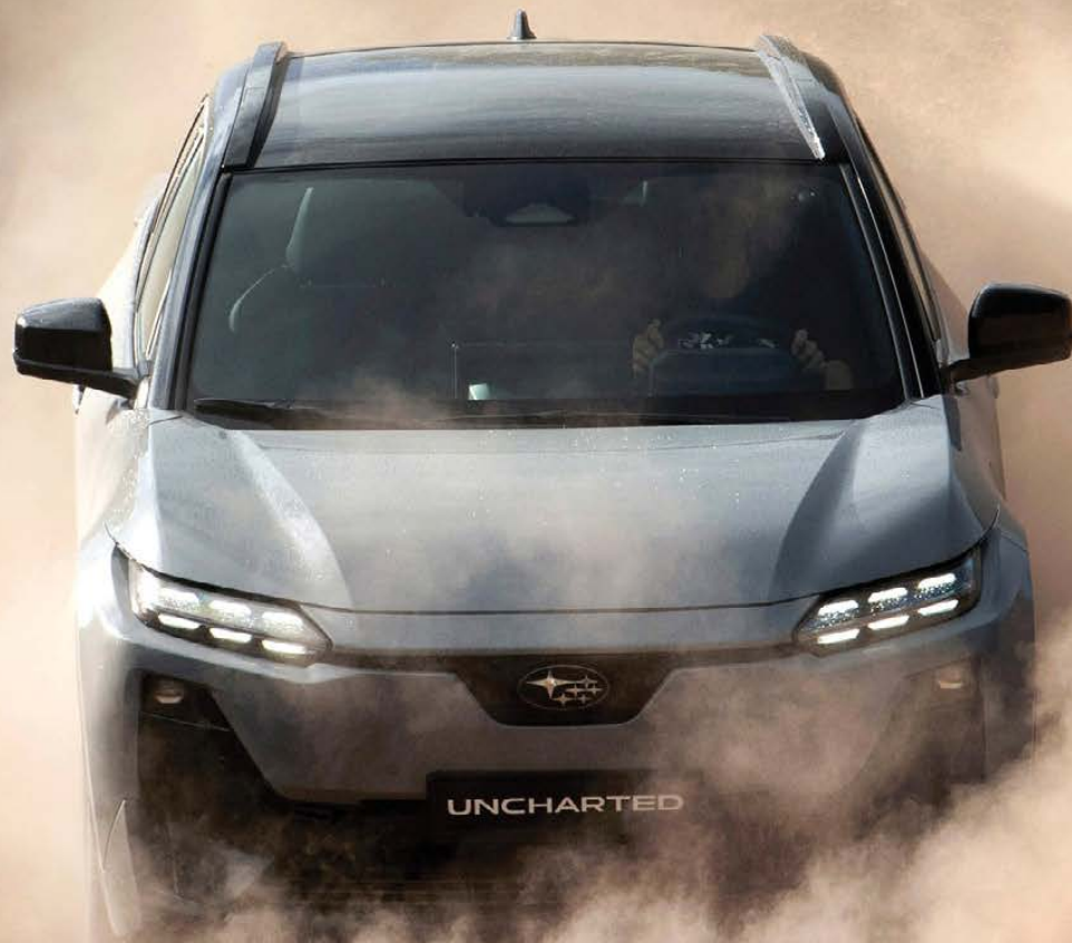
Image indicative only. Optional premium paint shown.