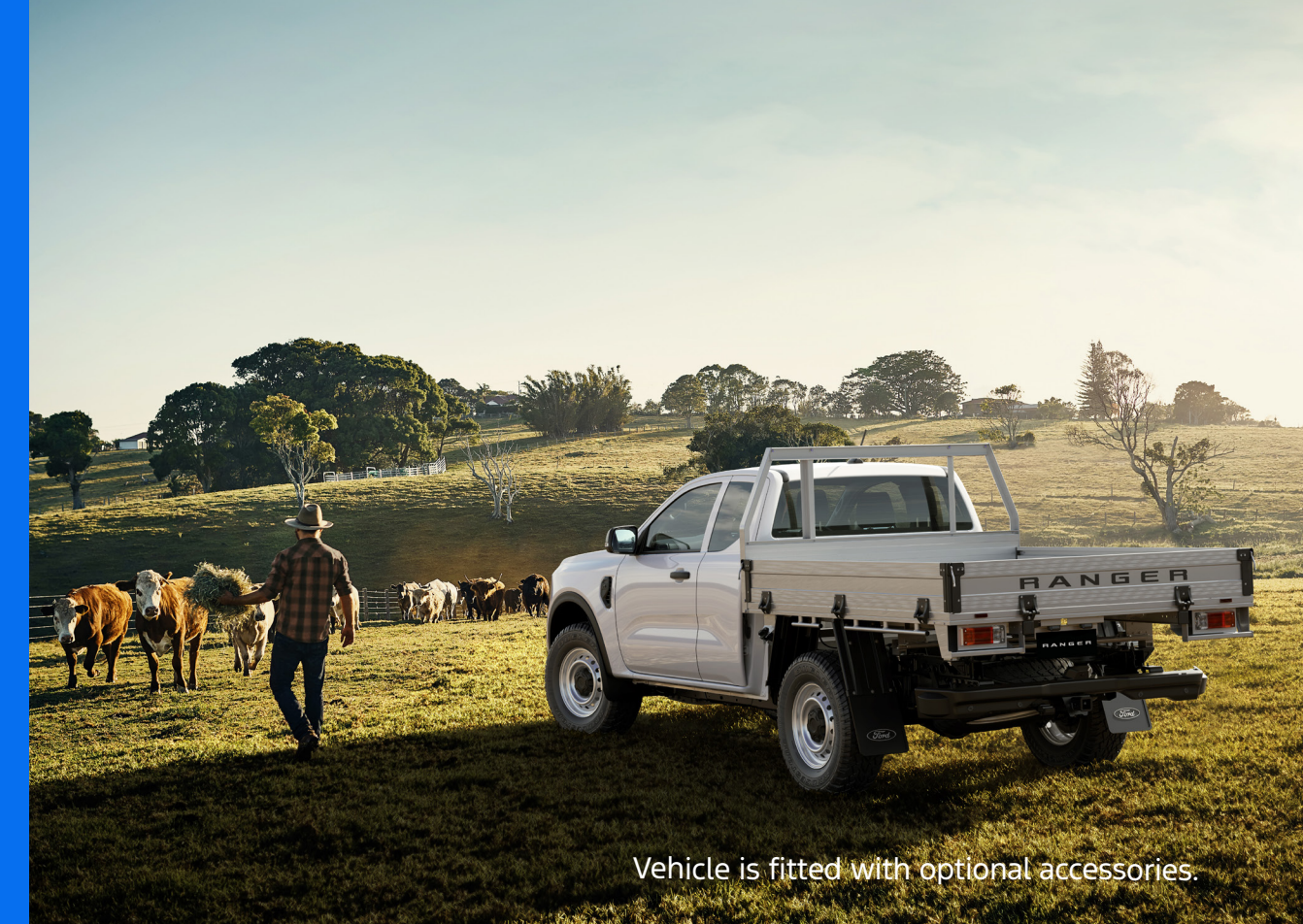
Vehicle is fitted with optional accessories.

Whether you're upgrading, switching models, or buying your first Ford, Ford Finance is here to shorten the distance between you and your next vehicle. Talk to one of our dealers to understand the benefits of choosing Ford Finance.