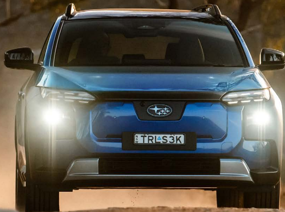
Image indicative only. Optional premium paint shown.