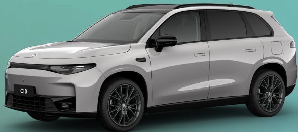
Terra Grey (0GD) (Optional)