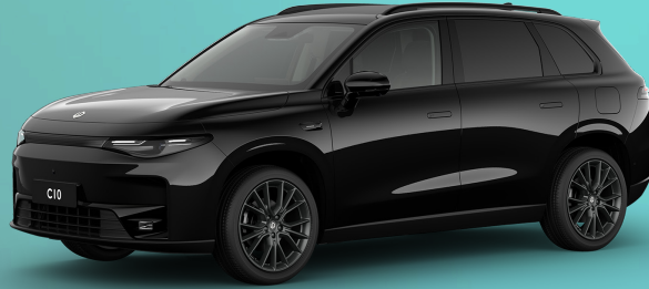
Metallic Black (0KL) (Optional)