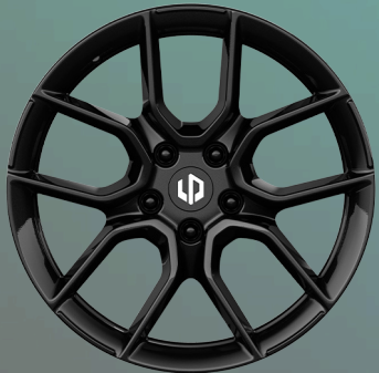
Double Five Spoke Wheel 18-inch alloys.