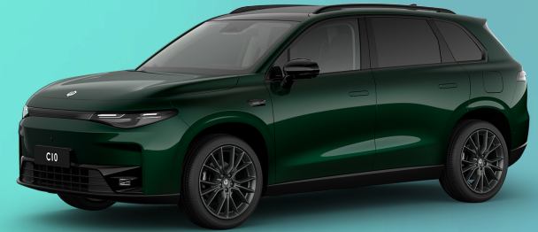
Jade Green (0YF) (Optional)