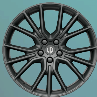
Trident Sporty Wheel 20-inch alloys.