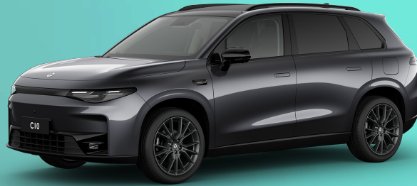
Midnight Grey (0GM) (Optional)