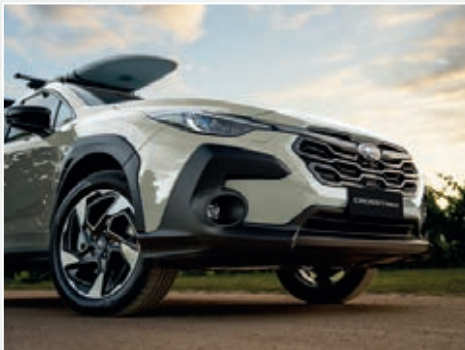
Subaru Crosstrek AWD Hybrid S 1

The future is now, with Subaru e-Boxer technology driving the Subaru Crosstrek Hybrid variants. The dynamic plug-free hybrids seamlessly team power from a compact battery and quiet electric motor, with the petrol engine for the ultimate in driving efficiency.