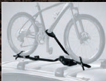
BIKE HOLDER - BLACK (PRORIDE)