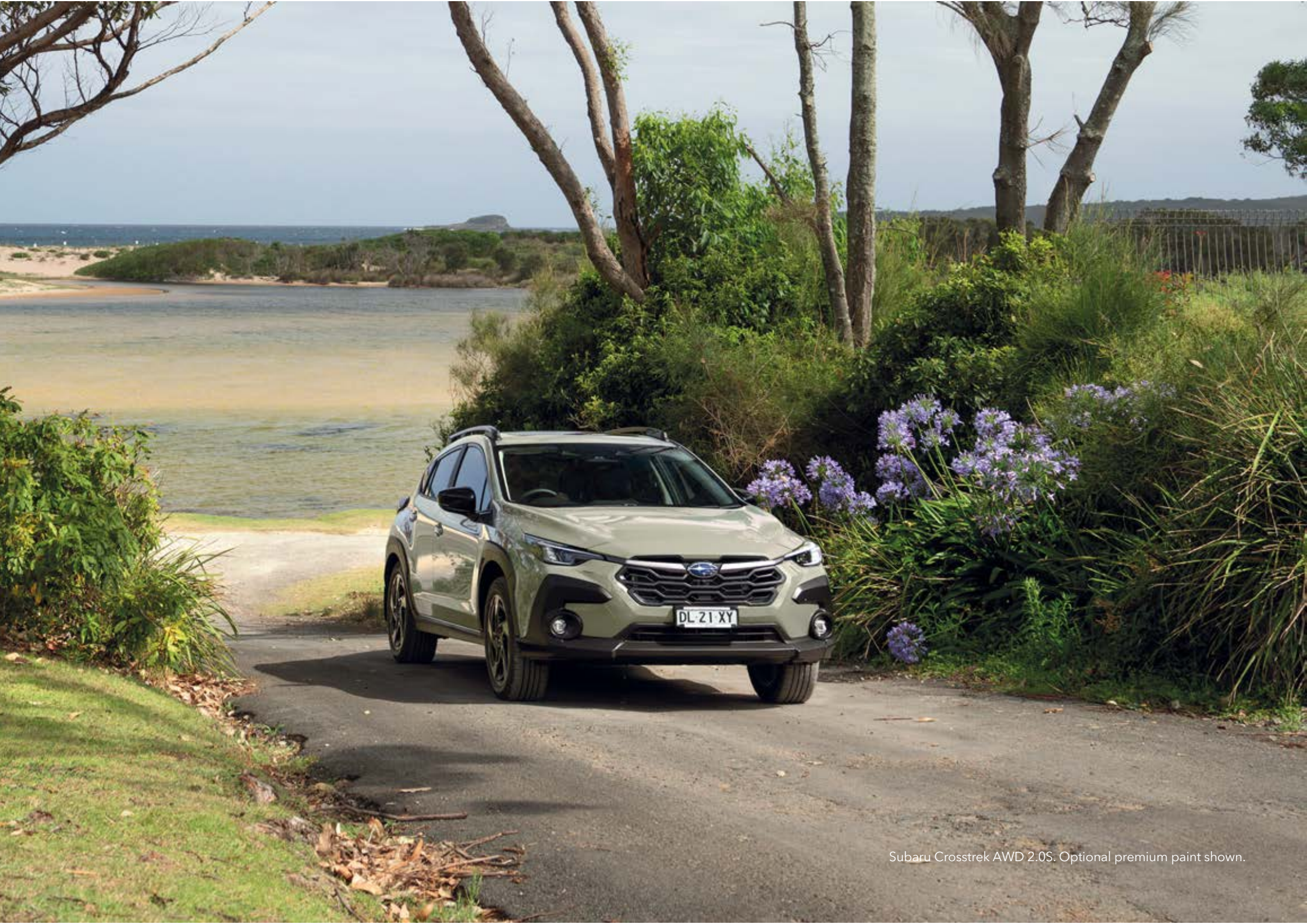
Subaru Crosstrek AWD 2.0S. Optional premium paint shown.