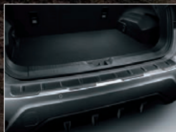
CARGO STEP PANEL (RESIN)