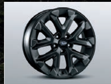
18 IN RUGGED WHEEL SET (MATT BLACK)