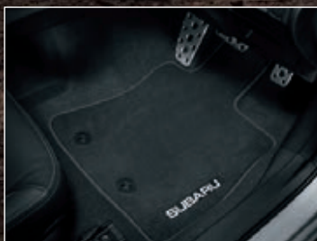
CARPET MAT SET