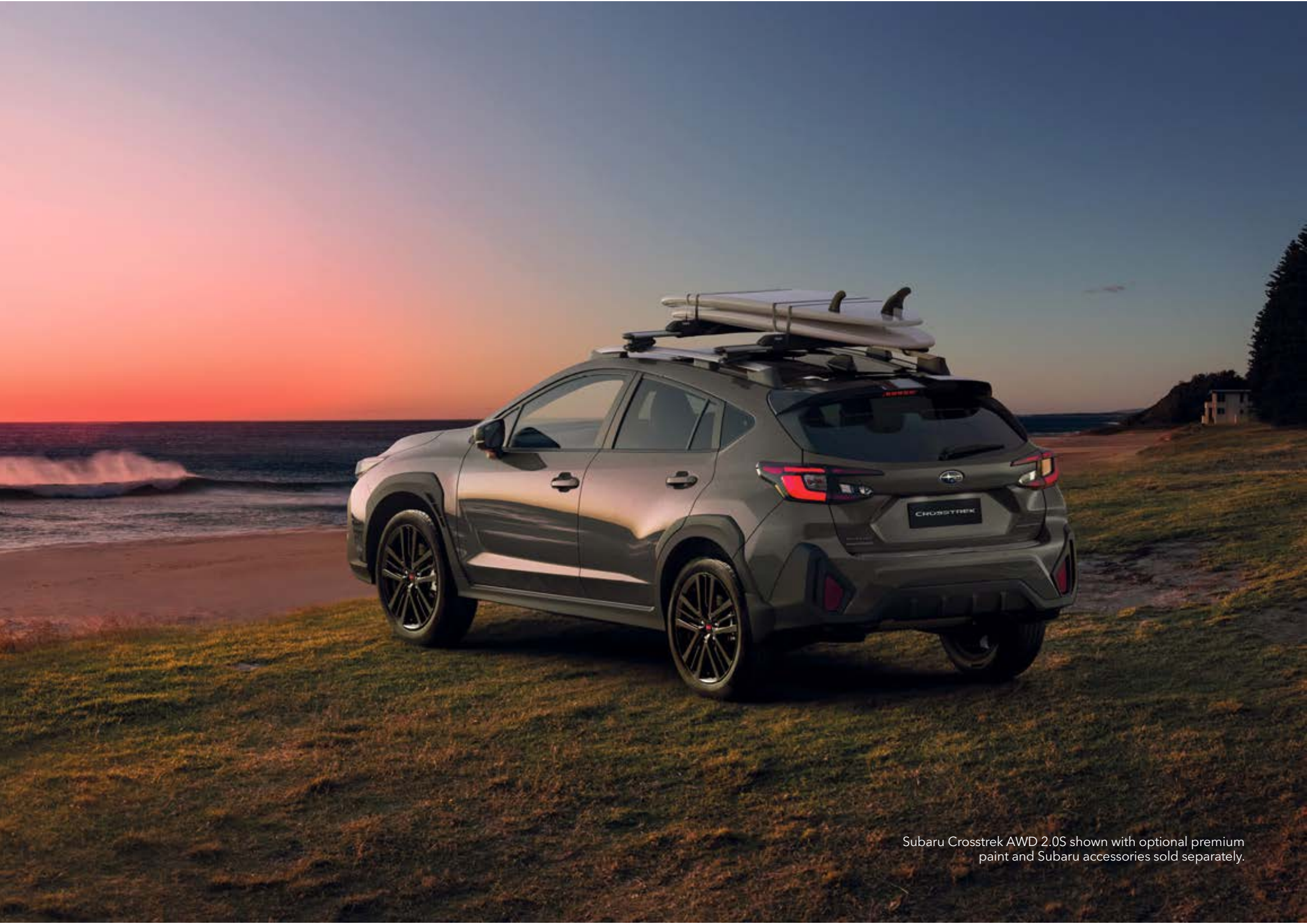
Subaru Crosstrek AWD 2.0S shown with optional premium paint and Subaru accessories sold separately.