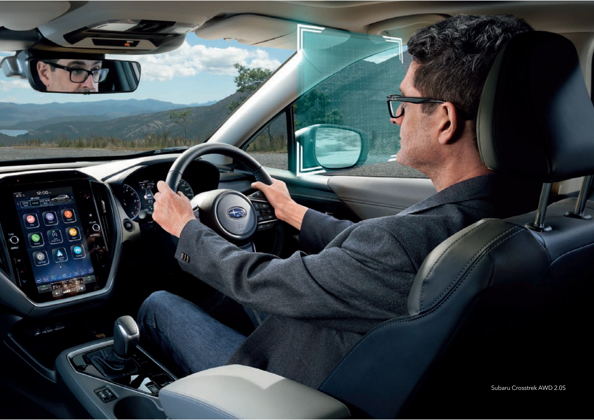
Subaru Crosstrek AWD 2.0S