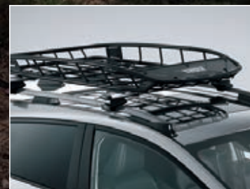
THULE ROOF BASKET