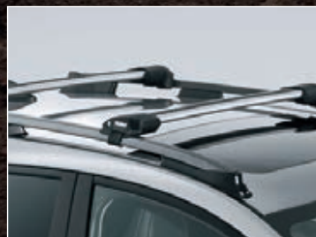
LOW PROFILE CROSS BARS