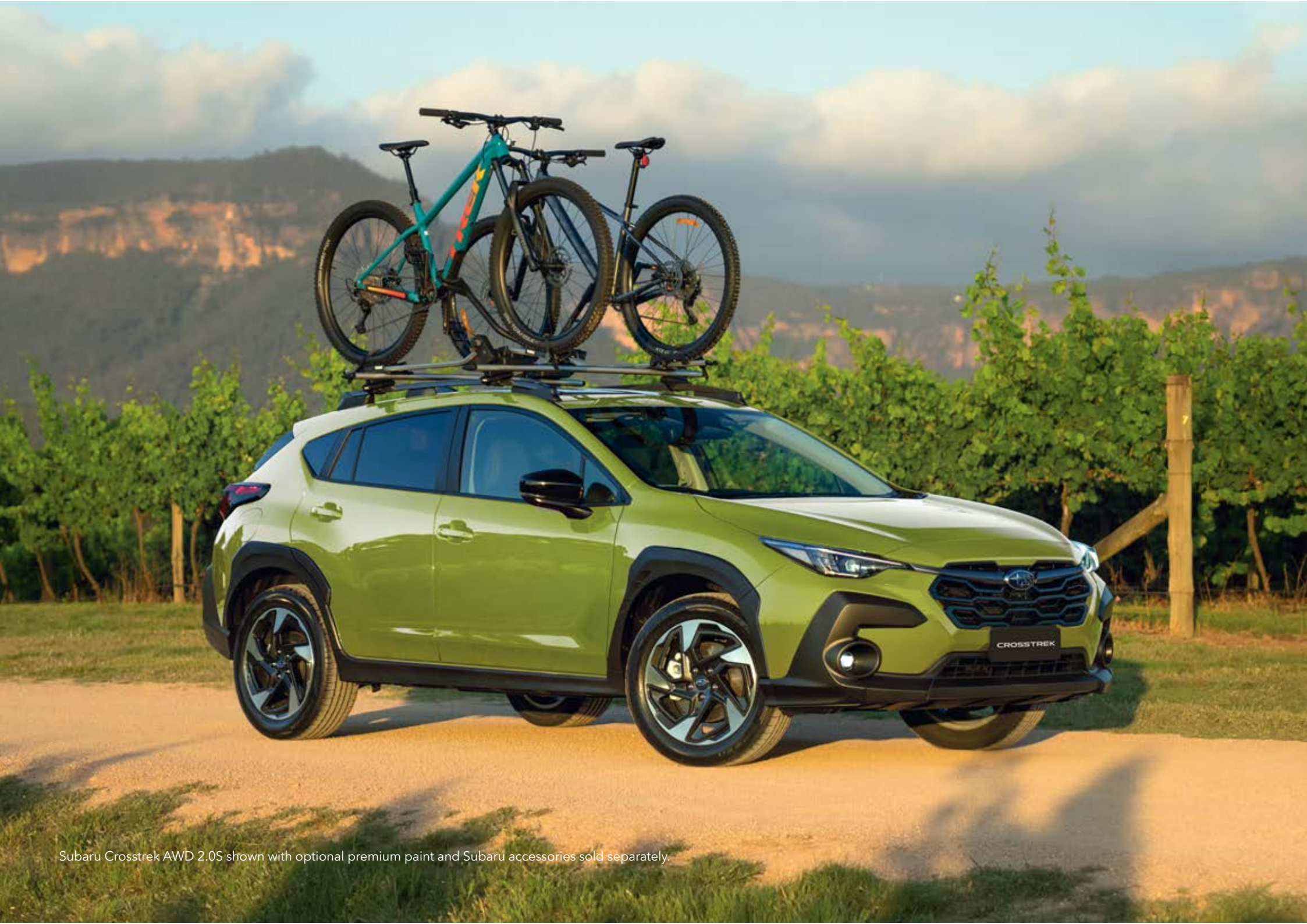
Subaru Crosstrek AWD 2.0S shown with optional premium paint and Subaru accessories sold separately.