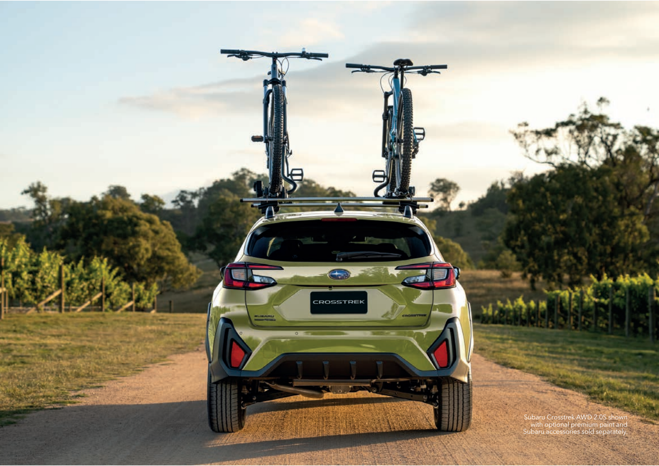
Subaru Crosstrek AWD 2.0S shown with optional premium paint and Subaru accessories sold separately.