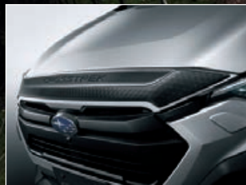
FRONT NOSE GARNISH