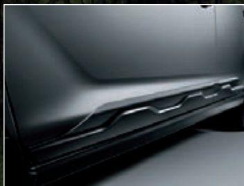
DOOR UNDER GARNISH