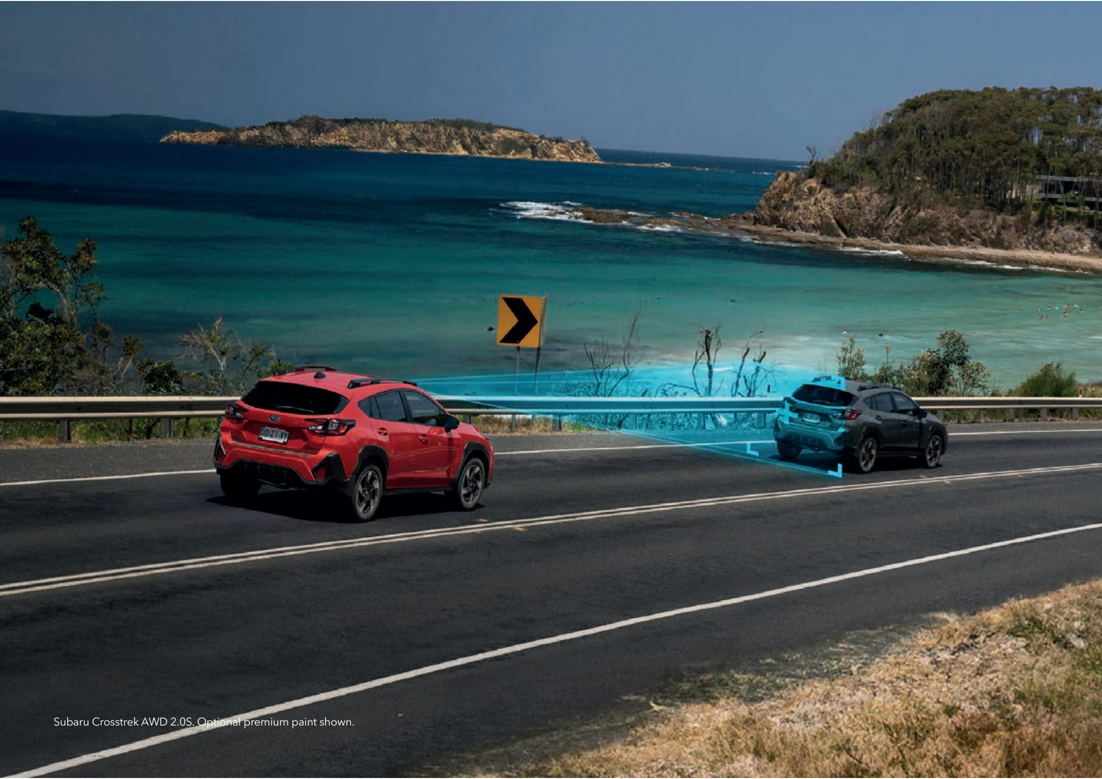
Subaru Crosstrek AWD 2.0S. Optional premium paint shown.