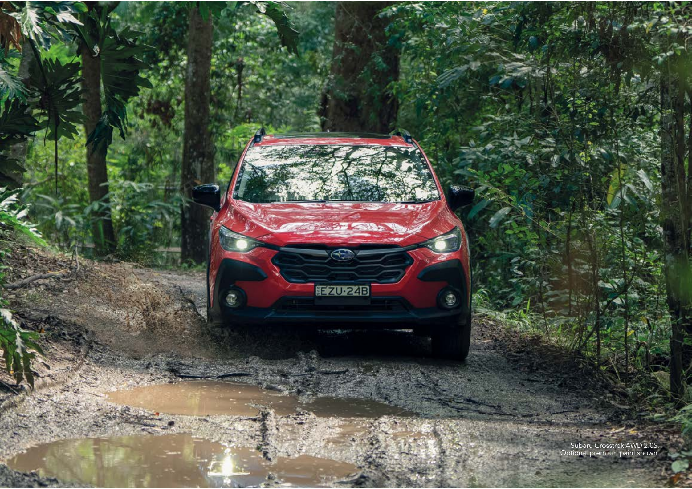
Subaru Crosstrek AWD 2.0S. Optional premium paint shown.