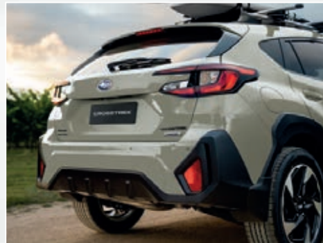
Subaru Crosstrek AWD Hybrid S 1