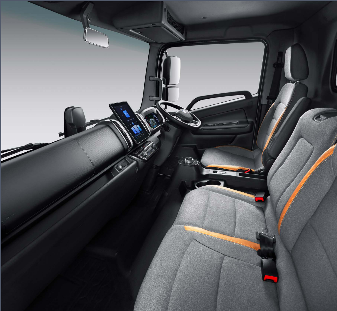
Premium fabric seats