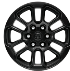
18-Inch mid-gloss black painted aluminium