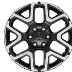
20-inch Premium-painted/ polished aluminium