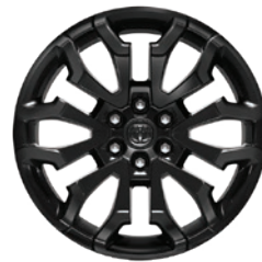
22-inch Premium black painted aluminium