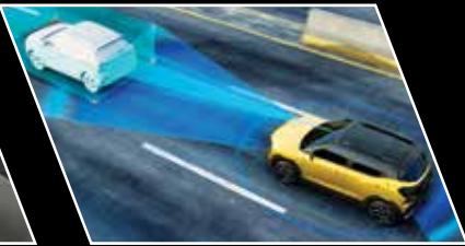
Auto Emergency Braking (Vehicles)