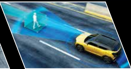
Auto Emergency Braking (Pedestrian)