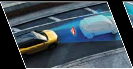
Forward Collision Warning