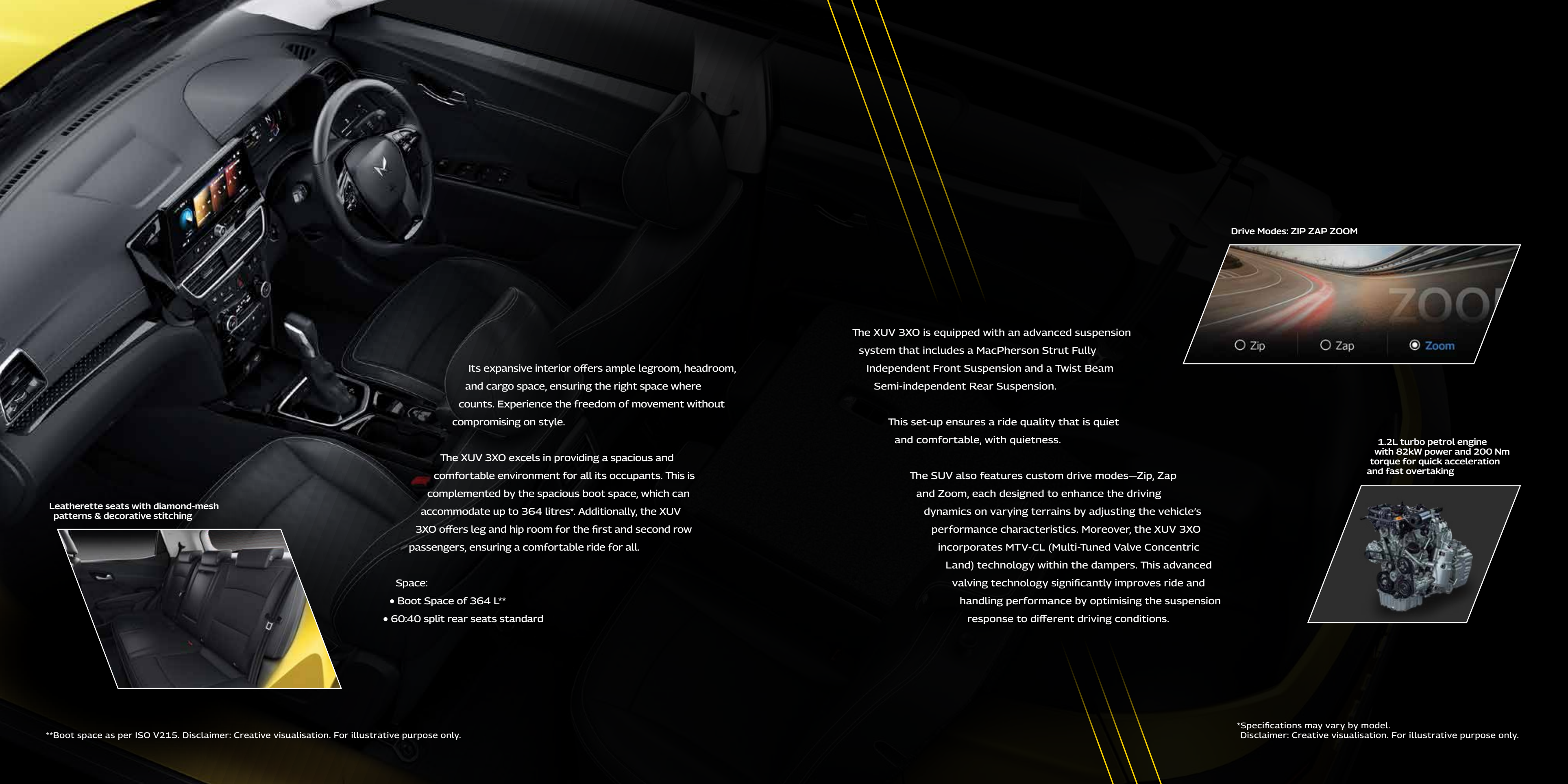
Leatherette seats with diamond-mesh patterns & decorative stitching