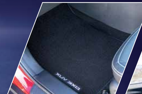
Carpet Floor Mats (Rubber Also Available)