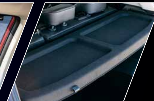
Parcel Shelf Cover

Contact your nearest dealer to get a full range of accessories available.