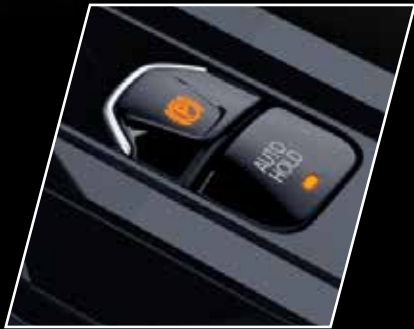
Electronic Power Brake & Autohold

The vehicle comes standard with six airbags, four disc brakes, 3-point seat belts and seat-belt reminder for all seats along with passenger airbag on/off for child safety, ISOFIX child seats with top-tether, among others, providing comprehensive protection for all occupants.