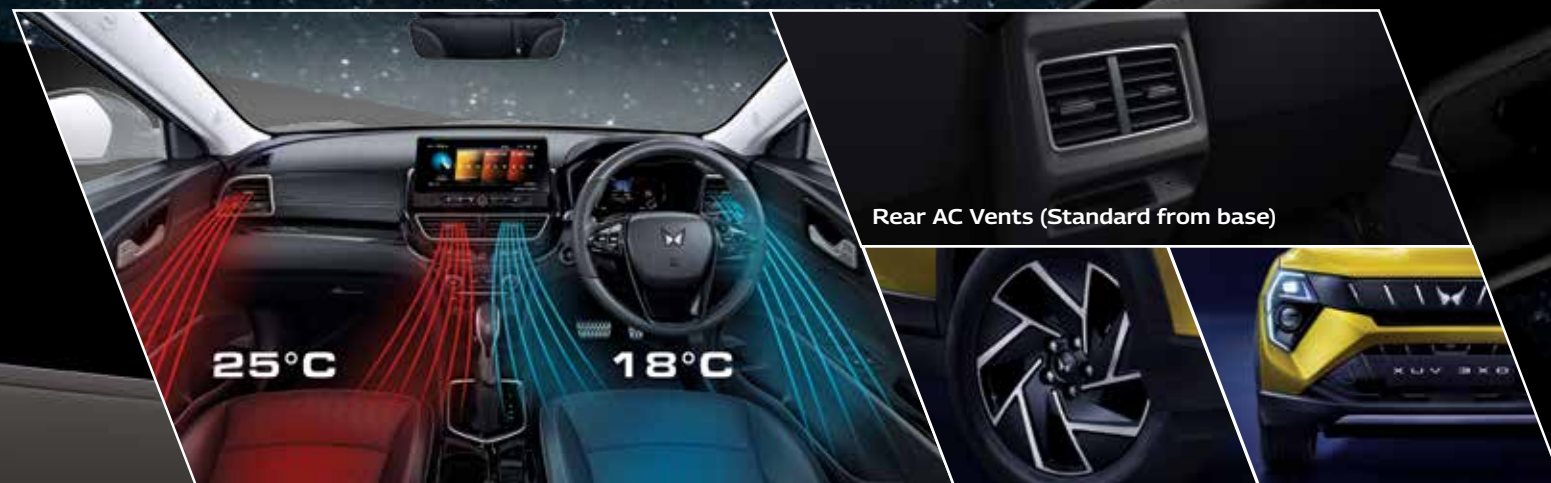
Dual Zone Climate Control