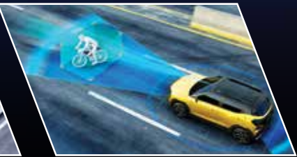
Auto Emergency Braking (Cyclist)