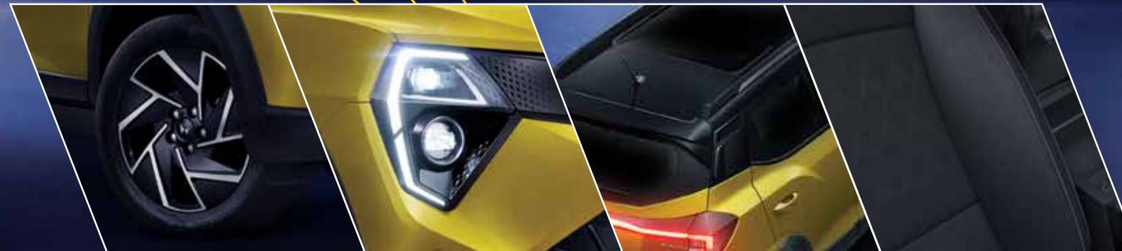
R17 Diamond Cut Alloy Wheels