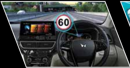
Traffic Sign Recognition