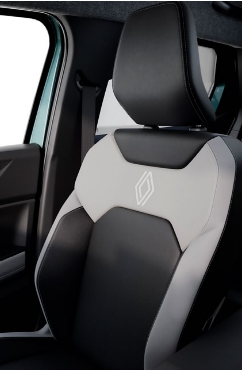
black and grey premium textile upholstery techno