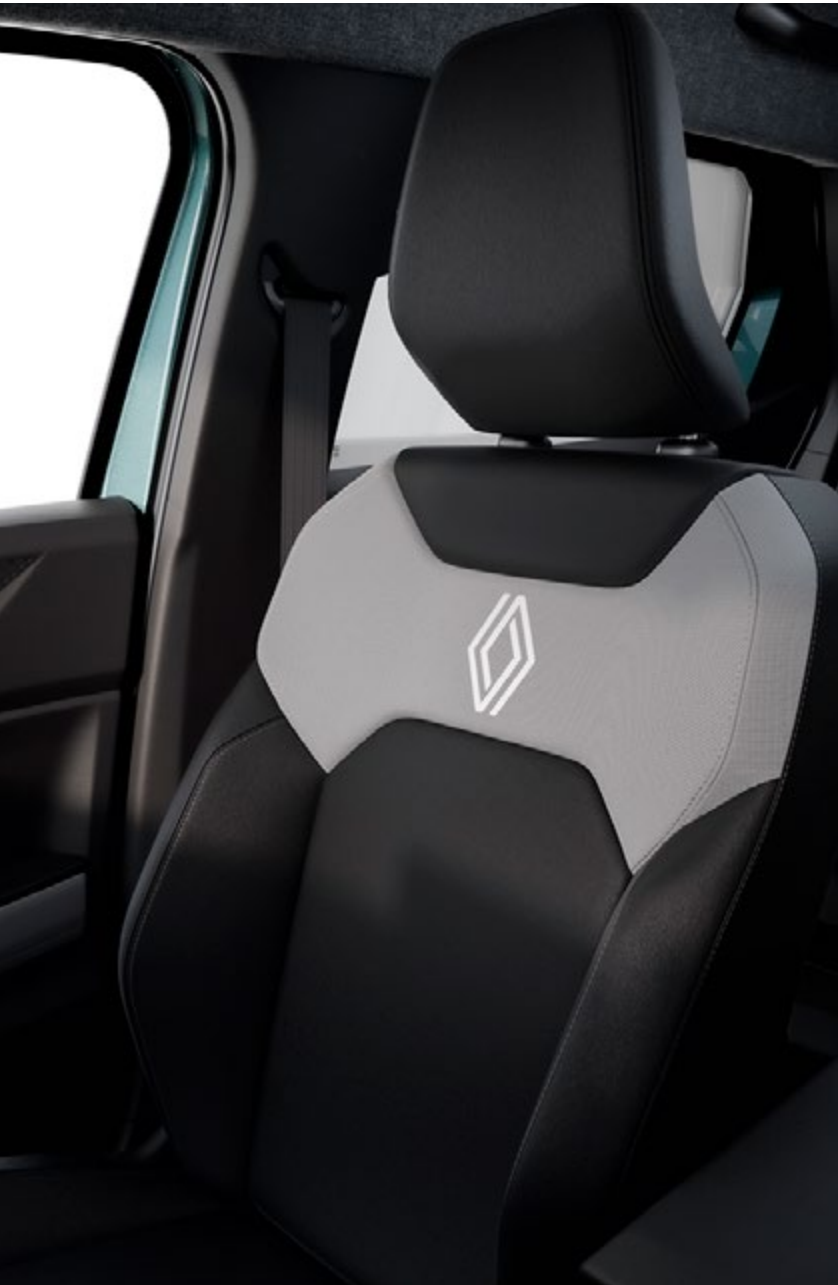
black and grey cloth upholstery evolution