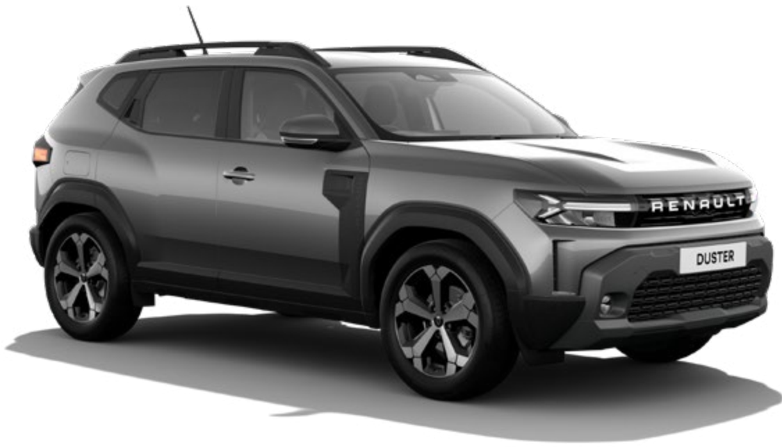
shadow grey (M)