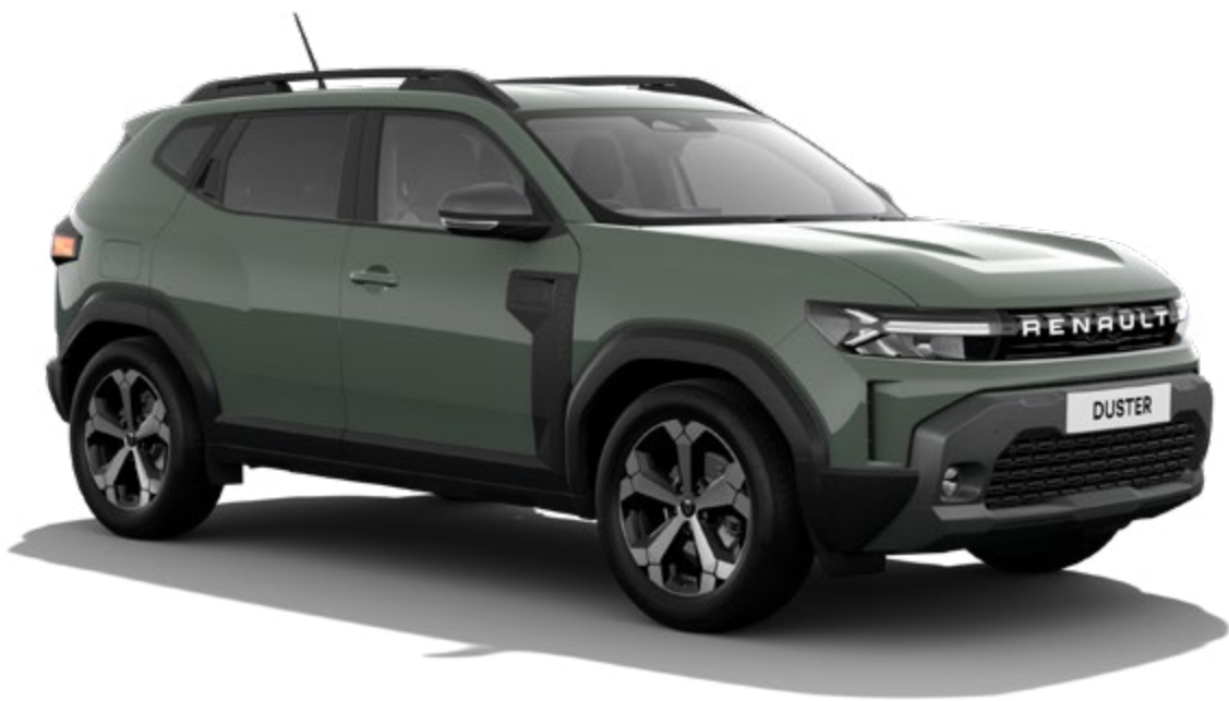
khaki green (SP)