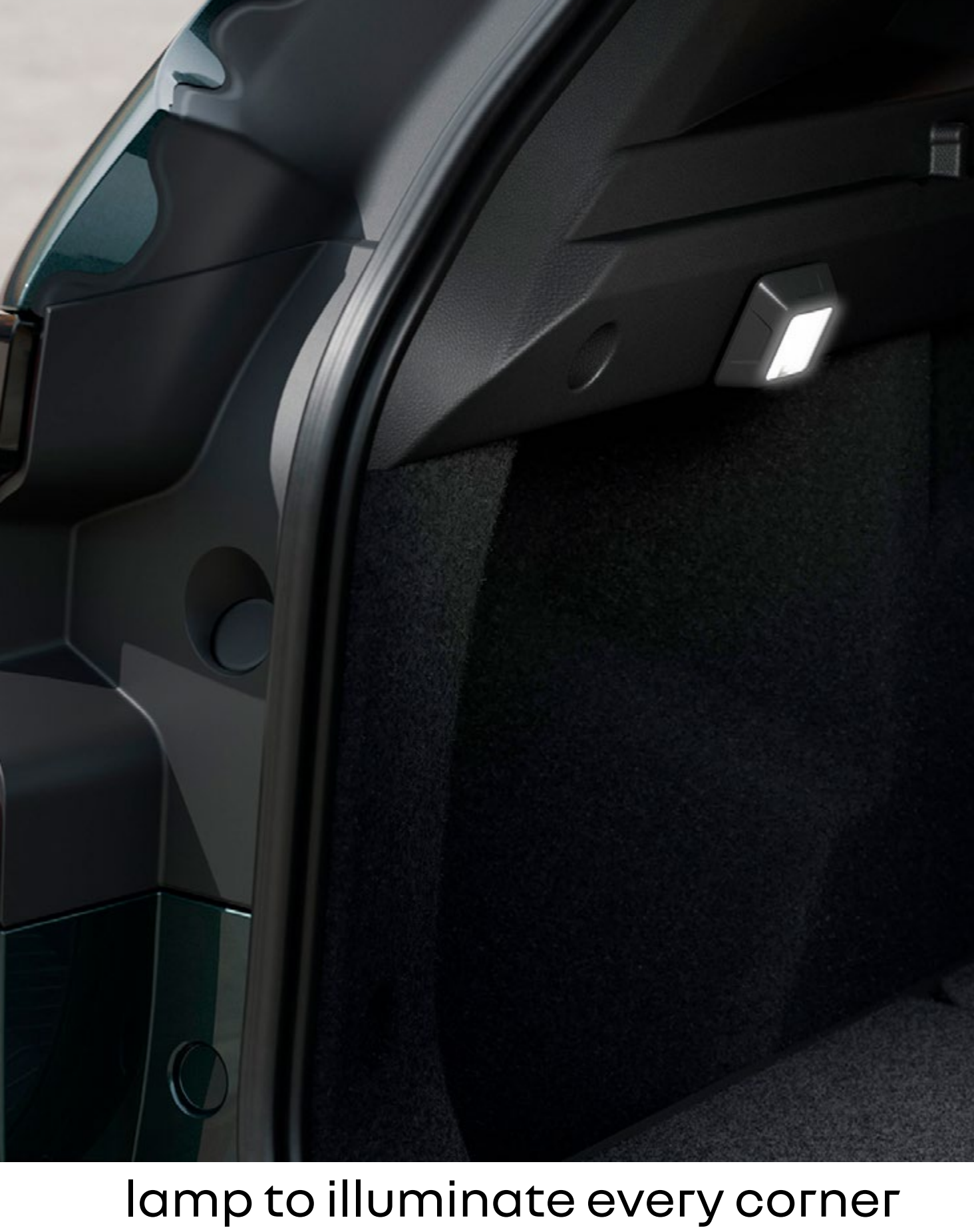
lamp to illuminate every corner

With the smart 3-in-1 accessory, you have a light, a cup holder, and a hook for your bag or cap.