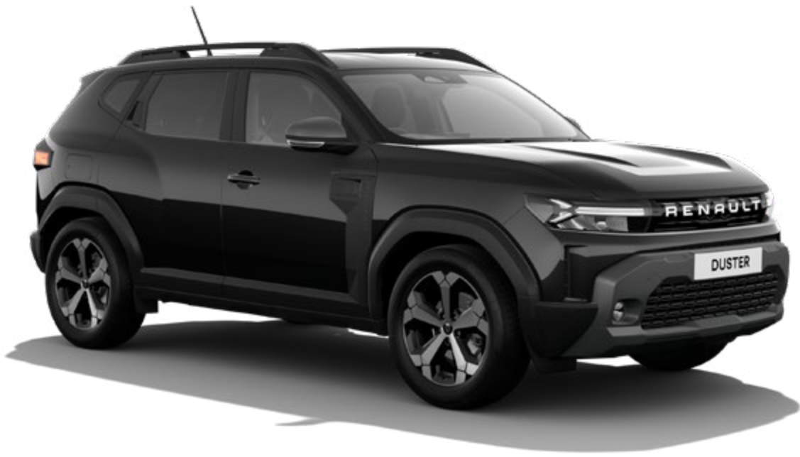
pearlescent black (M)