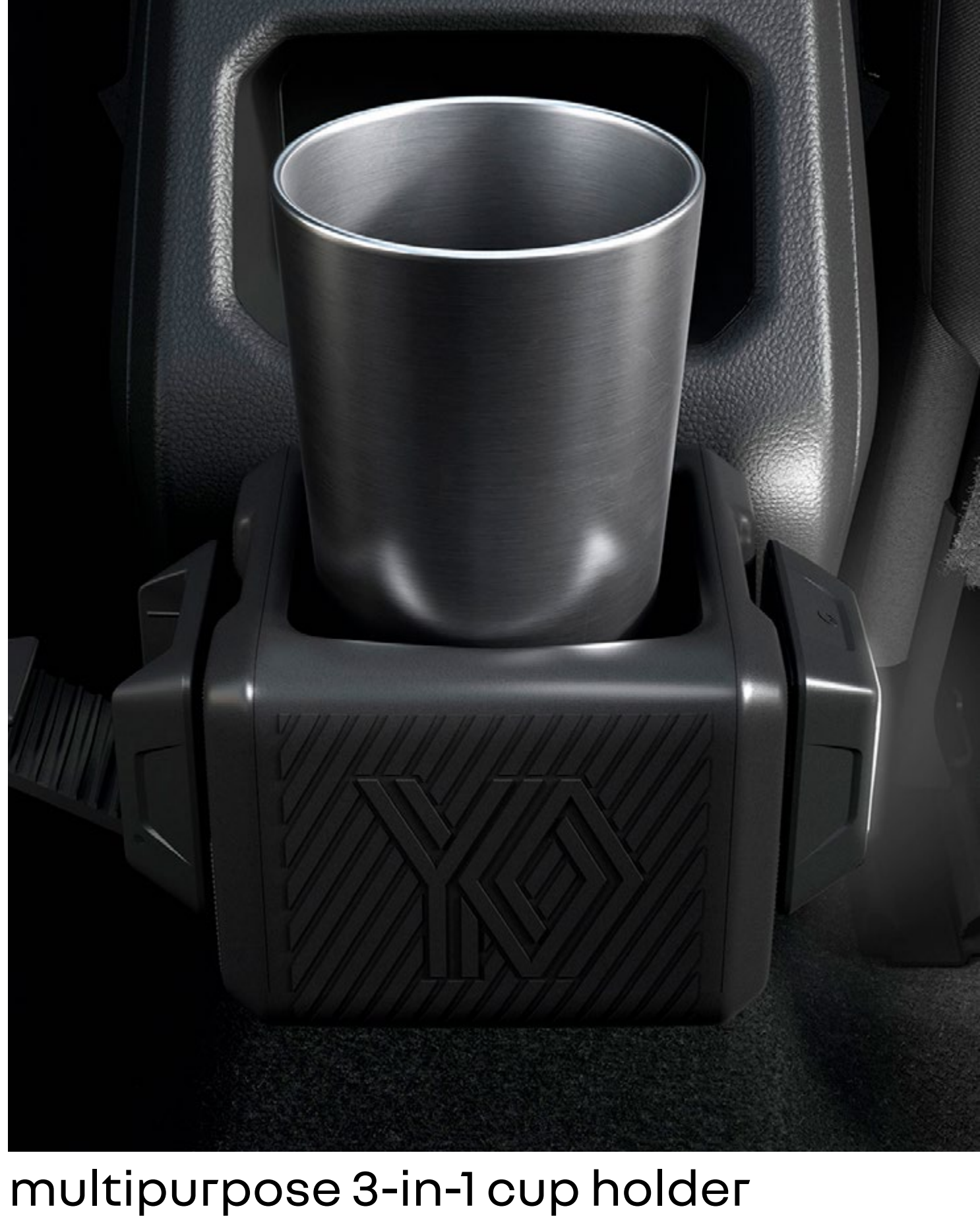
multipurpose 3-in-1 cup holder