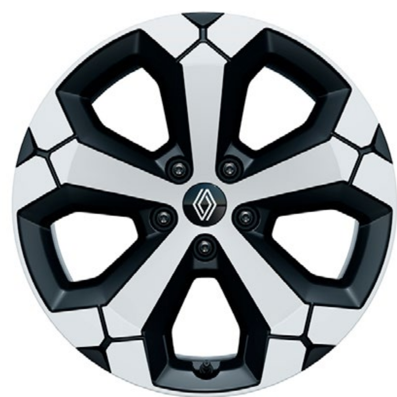
18-inch diamond cut 'exploration' alloy wheels techno