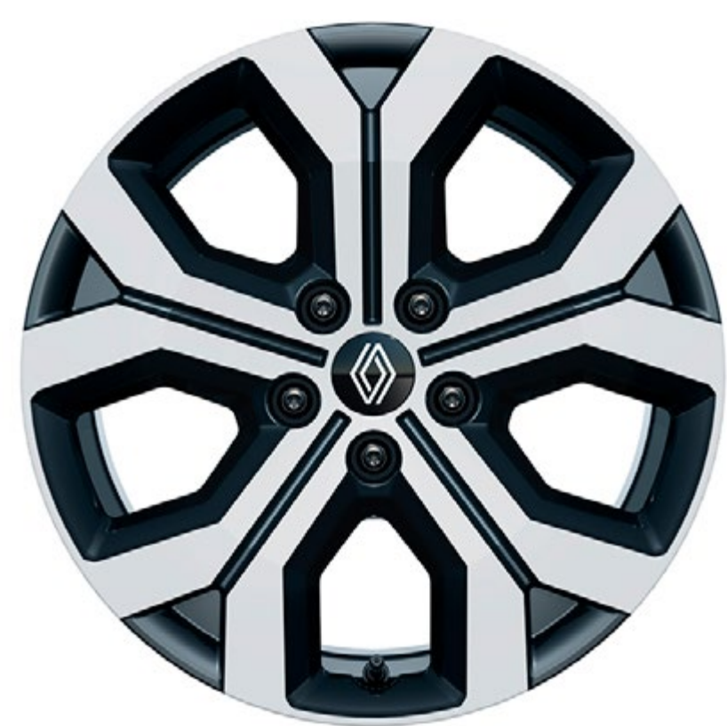
17-inch diamond cut 'adventure' alloy wheels evolution