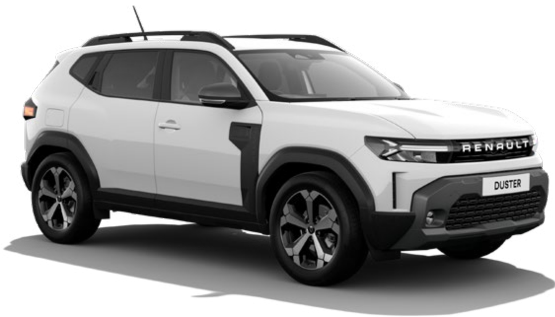
solid white (S)