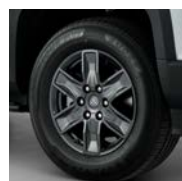
18" Dark Grey Alloys with 6 Spoke Design (Origin)