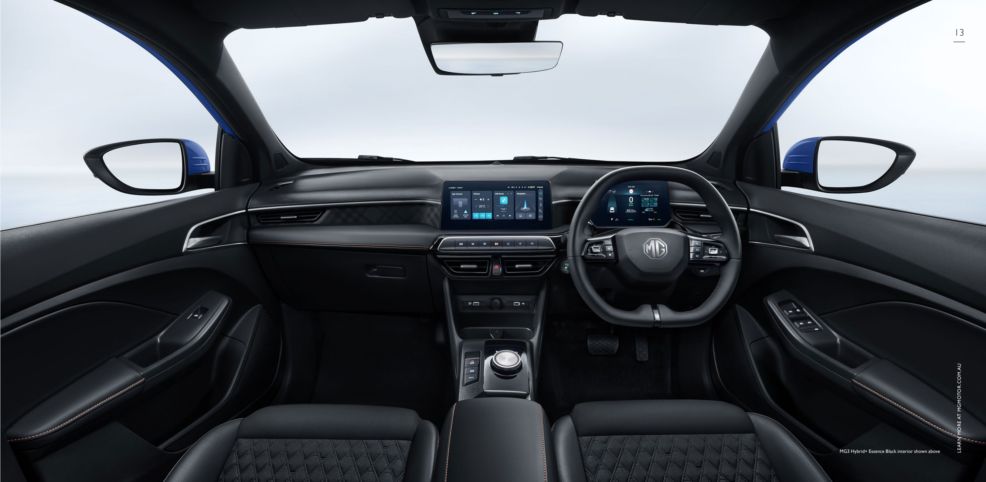
MG3 Hybrid+ Essence Black interior shown above