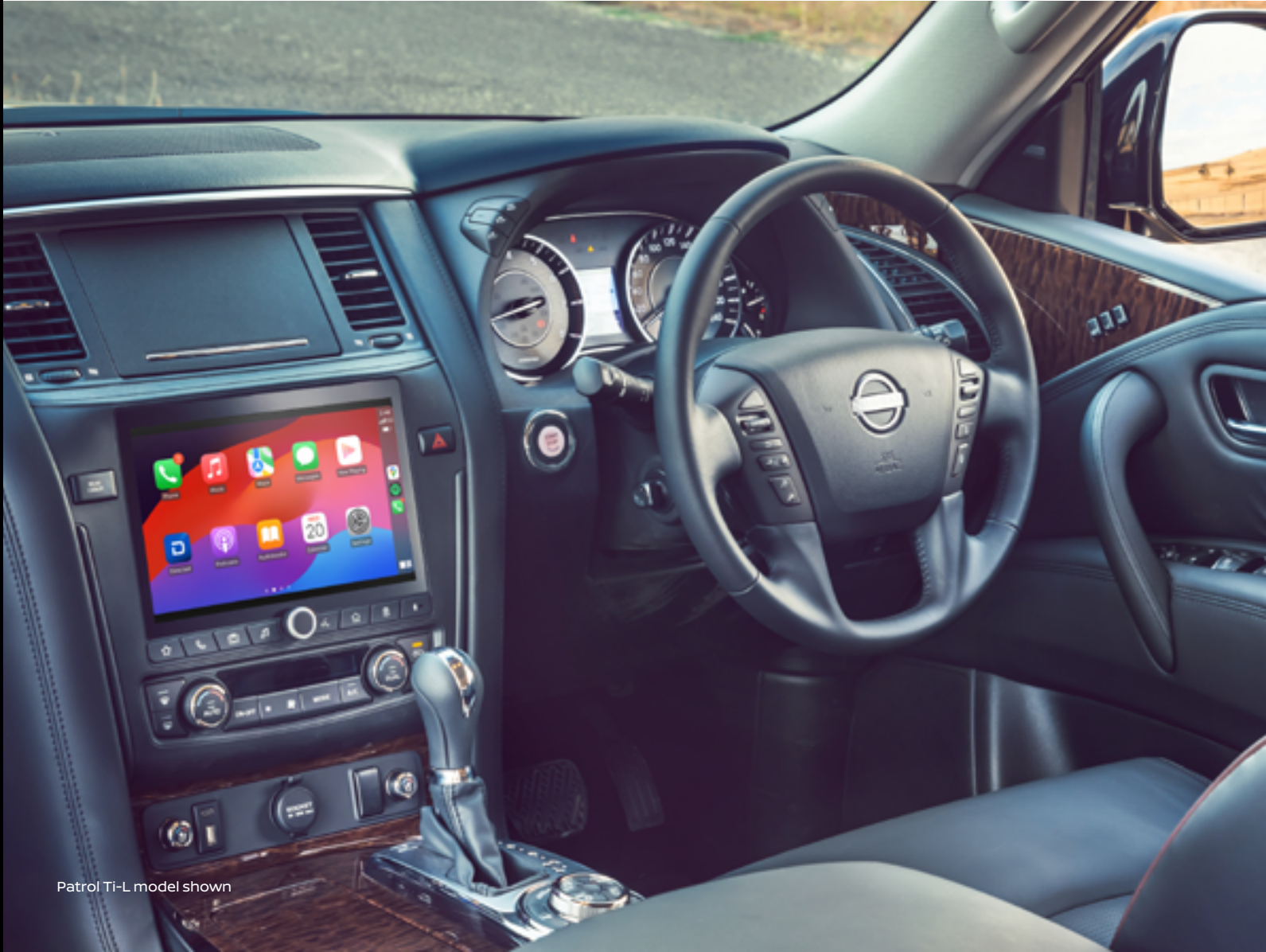
Patrol Ti-L model shown

Welcome to the new generation Patrol infotainment system. This accessory system has been locally designed and developed by Directed Technologies and comes with a range of features to enhance your journey.