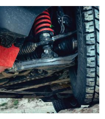
SUSPENSION & TRACK WIDTH

+ Yokohama® and Geolandar® are registered trademarks of Yokohama Rubber Co., Ltd. § The towbar as a system is certified to 3,500kg in accordance with Australian Design Rules.