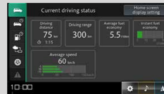
9-inch display audio on GLX

The display audio features the latest in digital convenience, including Apple CarPlay®, Android Auto™, voice recognition and hands-free Bluetooth® calling. Standard features also include radio, music and movie USB, iPod and Bluetooth® music playback. Keeping you in-tune with the vehicle, it also displays information such as fuel economy, driving range, warnings, rear-view camera, 360 view camera.