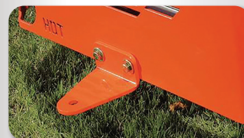
BOLT ON HITCH