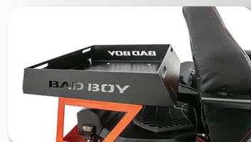
REAR MOUNT BASKET