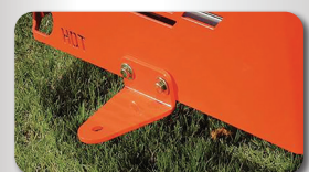
BOLT ON HITCH