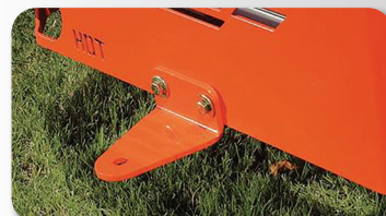
BOLT ON HITCH