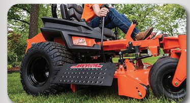
ADVANCED CHUTE SYSTEM