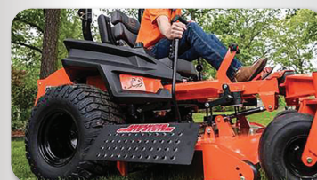
ADVANCED CHUTE SYSTEM