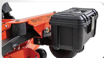
FRONT MOUNT TOOL BOX