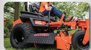
ADVANCED CHUTE SYSTEM