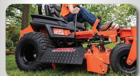
ADVANCED CHUTE SYSTEM