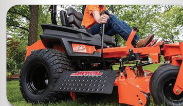
ADVANCED CHUTE SYSTEM