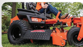
ADVANCED CHUTE SYSTEM