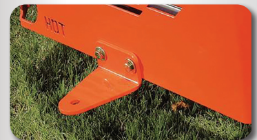
BOLT ON HITCH