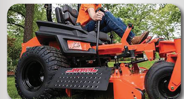
ADVANCED CHUTE SYSTEM