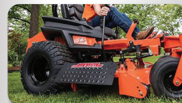
ADVANCED CHUTE SYSTEM