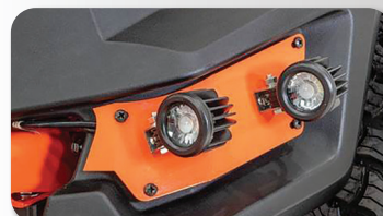
LED TANK LIGHT KIT