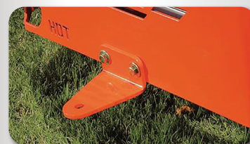
BOLT ON HITCH