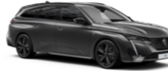
PLATINUM GREY 2