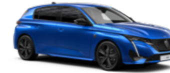
VERTIGO BLUE 1