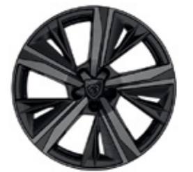
18" 'Portland' black diamond cut two tone alloy wheels (Standard on GT Premium Hatch & Wagon)

Note: Paint colours are representative only and subject to variation due to the printing process. 1. Colour only available on 308 Hatch variants. 2. Colour only available on 308 Wagon.