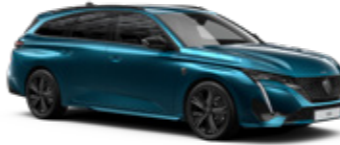
AVATAR BLUE 2