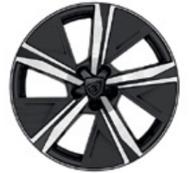
18" 'Kamakura' black diamond cut two tone alloy wheels (Standard on GT Hatch)