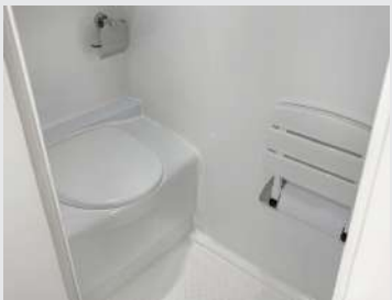
Interior bathroom with toilet & Shower for total convenience