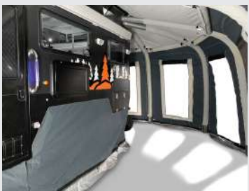
Add on an inflatable annex to create an extra living space