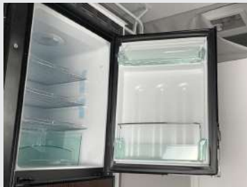
Installed Internal fridge & Plenty of Bench Space

SOFT TOP HYBRID CARAVAN WITH FOLD OUT BED & DUAL BUNK BEDS