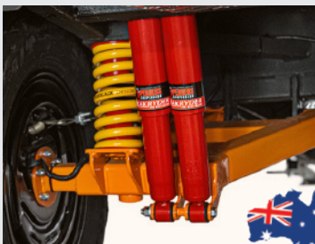
Australian Made & Engineered Suspension System