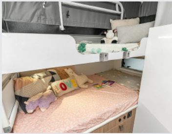
Twin bunks up the front make sleeping the little ones easy

LITHIUM BATTERY WITH PROJECTA CHARGER MANAGEMENT SYSTEM