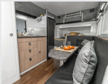
Neat layout which makes use of every space for seating or storage