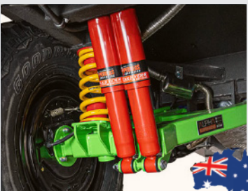
Australian Made & Engineered Suspension System