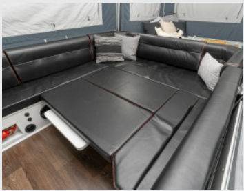
Convertible Lounge-To-Bed Seating Area

LITHIUM BATTERY WITH PROJECTA CHARGER MANAGEMENT SYSTEM