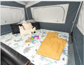
Rear Slide Out Bed Perfect for the Little Campers