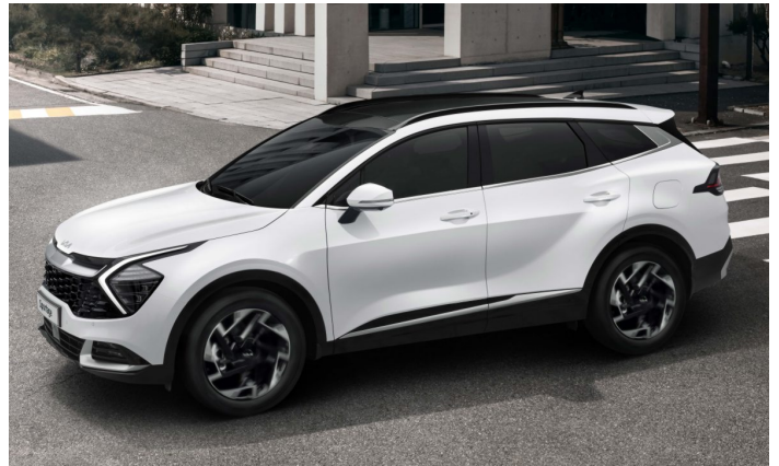
*Picture provided is a sample only